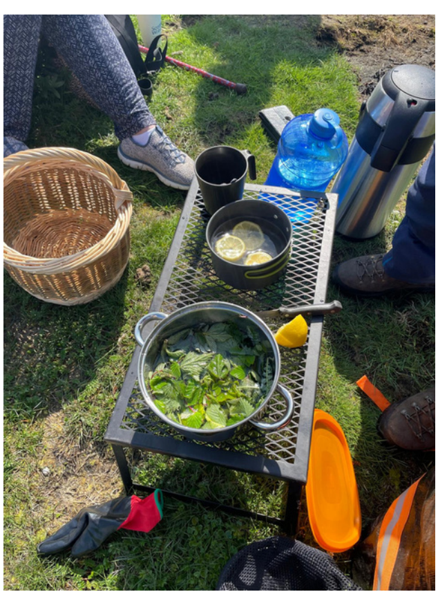
Tea making

We also ran our medicinal plants and tea making walk. We took a gentle ramble down the Druimyeon Bay Link path taking a closer look at some easily identifiable plants and chatting about their medicinal properties throughout time and nowadays. We then made some tea infusions at Druimyeon Bay using nettles, silverweed, sorrel, hawthorn and bramble leaves. We had such beautiful weather for the walk – thank you to everyone who came along, it was fabulous!